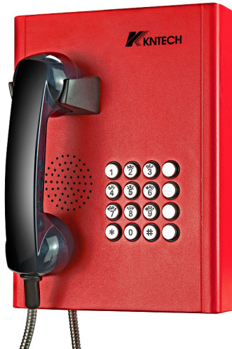
VoIP KNZD-27 Wall Mount Telephone